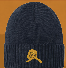
Navy with Cruise logo