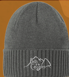
Grey with BOC logo