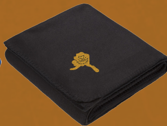
Black with Cruise logo