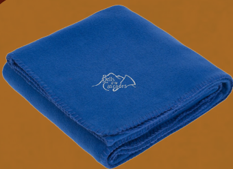
Blue with BOC logo