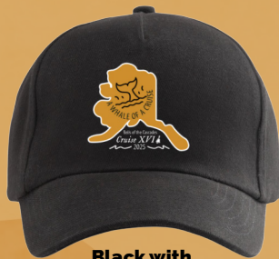
Black with Cruise logo