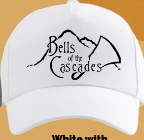
White with BOC logo