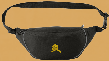
Embroidered Hip Pack Polyester Canvas 2 zipped parts; reflective trim Adjustable waist strap $15.00 each

All items have the CRUISE XVI or BOC Logo on them!